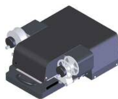
with Manual Roll Film Carrier Kit (option)