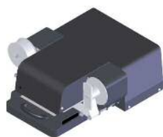
with Motorized Roll Film Carrier Kit (option)