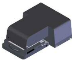
standard Fiche Carrier model